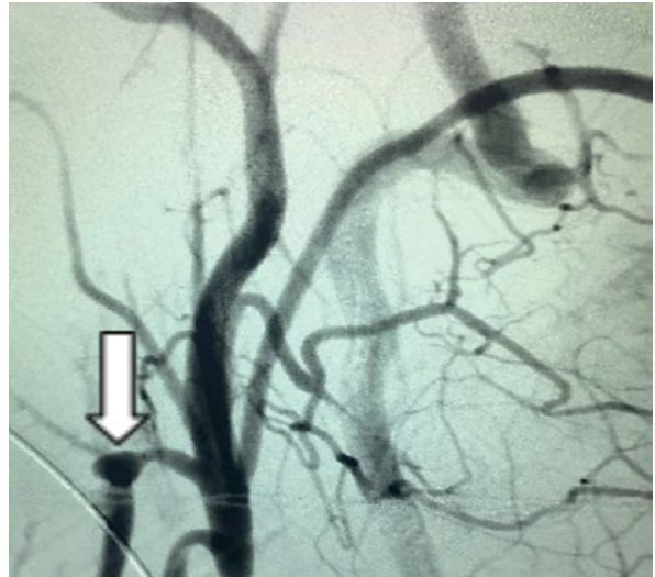
Fig. 1. Computed tomography angiogram of carotid arteries demonstrating a small pseudoaneurysm arising from the left facial artery

Once the patient's vital signs stabilised, an examination under general anaesthesia was performed in the operating theatre. Active bleeding from the left tonsillar fossa was found. Initially, the haemorrhage was controlled for 10 minutes with electrocautery of the left tonsillar fossa, but the bleeding was still profuse in the same setting of examination under anaesthesia (EUA). Therefore, packing of the tonsillar fossa was done, but haemostasis was not achieved. Thereafter, haemostatic suture was applied, but failed. Left external carotid artery (ECA) ligation above the superior thyroid artery level was performed due to the failure of all other haemostatic methods. No more bleeding occurred at left tonsillar fossa after left ECA ligation. There was inflammation and granulation tissue in the left tonsillar fossa with no evidence of deep dissection or extensive eschar from the initial tonsillectomy. The patient was discharged in a good condition after five days post-operatively. Ten days later, he reported to the emergency department with sudden onset of haematemesis at home.